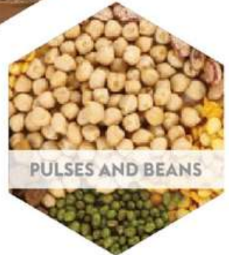
PULSES AND BEANS