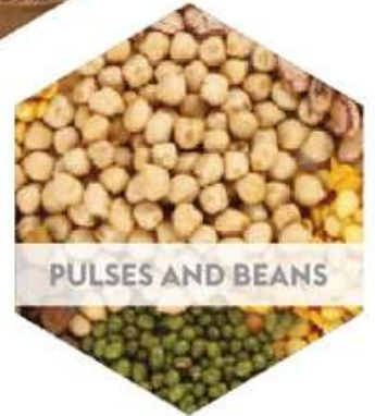
PULSES AND BEANS