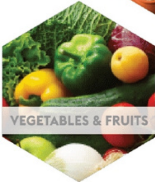
VEGETABLES & FRUITS