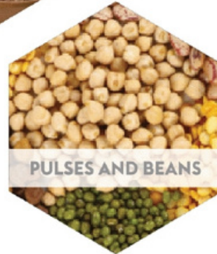
PULSES AND BEANS