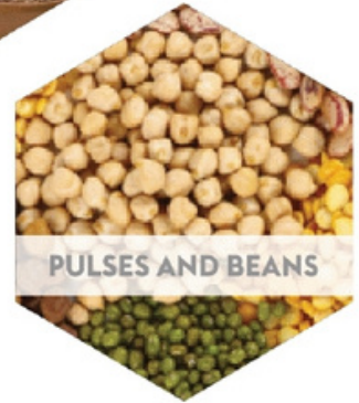
PULSES AND BEANS